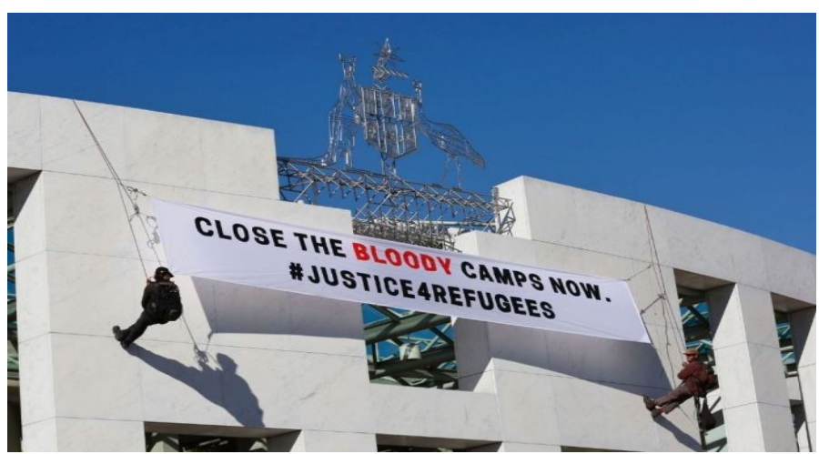
Politically Expendable? Atcivists unfurled banner on Australian Parliament House, calling for the closure of RPCs.

14. These asylum-seekers, indeed, have no political representation, such as strong connexion with constituents, within Australia. There, of course, are vocal and vibrant refugee-rights activists. However, they are very much in minority and the government considered them "politically expendable".