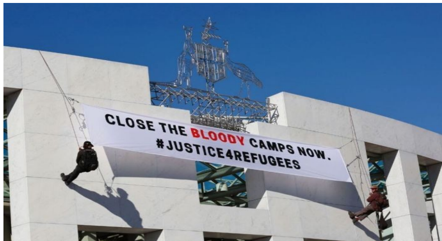
Politically Expendable? Atcivists unfurled banner on Australian Parliament House, calling for the closure of RPCs.